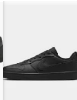
Nike Court Borough Low Recraft Older Kids' Shoes - ... £49.99 Nike Official