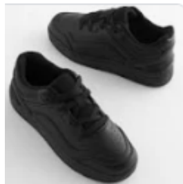
Boys Next Black School Leather Lace-up Shoes - Black £27.00 Next