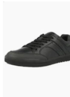
Geox J Arzach D Black Leather Boys Trainers £55.00 Awesome Shoes