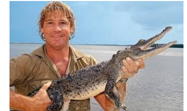
Sir Steve Irwin

You can pick one of these, or you can research a different one.