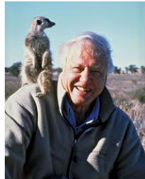
Sir David Attenborough