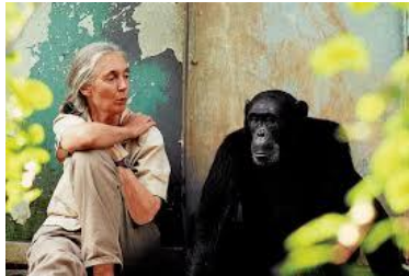
Dr Jane Goodall